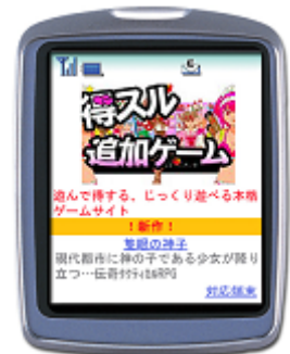
Tokusuru-Tsuika Games: Get More! Multiplying Games TOP Screen ( Image )

Now, the battle between humans and demons begin!