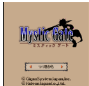
“Mystic Gate” TOP Page ( Image )

(C)GignoSystem Japan, Inc. (C)RideonJapan,Inc.