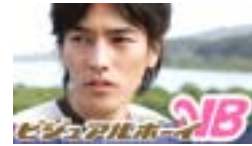
“ Visual Boy” Logo