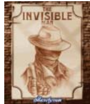
The Invisible Man TOP Screen (Sample)

The game "The Invisible Man," which is currently available, is based on the science fiction novel "The Invisible Man" written by H.G. Wells in 1897, who also wrote "The War of the Worlds," and "The Time Machine." The setting is London in 1899. The main character, "The Invisible Man," walks the streets of London in order to find the chemicals he needs to make himself visible again. All the while, police is chasing him. This is an exciting role-playing game.