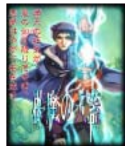
“Nightmare Sky” Image screen (Sample)

This is a dark world action RPG set in modern times. An alienated man named Judgeman Raker is attracted by magic and offers his wife and daughters as a sacrifice to the gods of an alien world. His son named Jin Raker, who used to study magic, is on a dark trip by himself in order to stop his crazy father, who became an apostle of the gods in the alien world and keeps making a gateway between multiple dimension universes and the existing world.