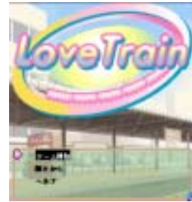
“ Love Train” Image screen(Sample)

The player must improve himself depending on which girl he is targeting in order to declare his love.