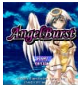
“Angel Burst” Image screen