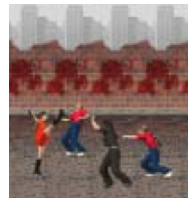
“ Junky Blow”Image screen(Sample)

If there are five or more items, it is possible for the player to use the “Junky Blow,” which can greatly damage the enemy.