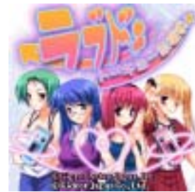
“Tokyo Love Private Detective” Image Screen(Sample)

Why don't you approach and get to know that girl from the not-too-distant future Tokyo! This is a love adventure game. The setting is Tokyo in the not-too-distant future and the main character is an intelligent freelance worker. He has a “Mobeach” phone to find girls throughout Tokyo. Why not meet and get to know girls using your “Mobeach” phone's functions and your good judgment.