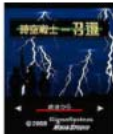
Space-time Warrior – Summon