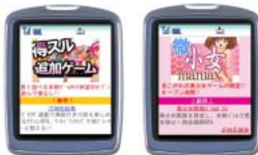
Site top page screen (Image)