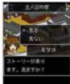
Tale of the Sword God